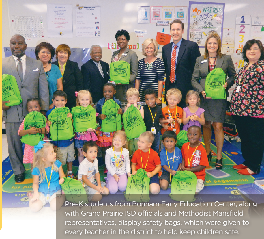
Pre-K students from Bonham Early Education Center, along with Grand Prairie ISD officials and Methodist Mansfield representatives, display safety bags, which were given to every teacher in the district to help keep children safe.